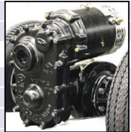
GT Automotive Drive